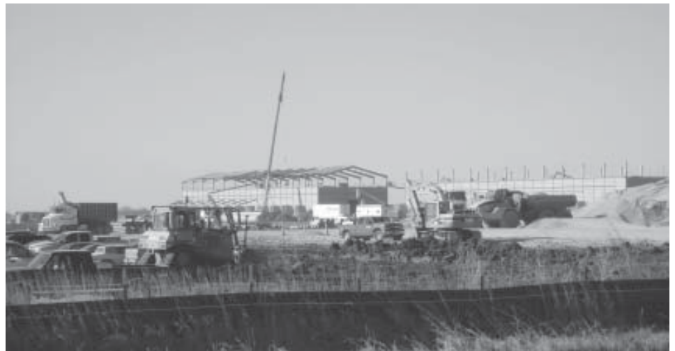
Monsanto plant at the intersection of Hwy 34/69

Temporary services are built and construction is in full-swing at the Monsanto plant 3 miles east of Waco on Hwy 34. Crews will begin building 8 miles of transmission line to the new site starting around March 1, 2009. They will also build a new substation to serve the expected 18 megawatt load. Monsanto hopes to have the plant fully operational by June, 2009.